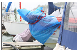
The Dive! Tutukaka Rescue boat was smashed on rocks during a callout.

Two of the men remain in Middlemore Hospital today in a stable condition with serious facial injuries, with one scheduled to have surgery. The three other volunteers were released from Whangarei Hospital yesterday.